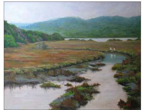
Great White Egrets , Roger Heuck