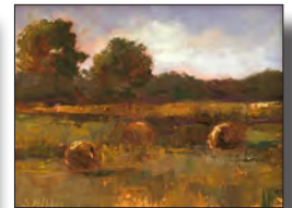
Field of Gold

Local Color , is an eye-catching exhibit and sale, showcasing Plein Air paintings created from local landmarks, rural landscapes, gardens, as well as still lifes created at our Studio in Montgomery. Tiny Treasures will also be available for purchase.