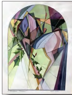
A Christmas Carousel