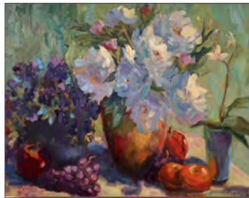
Peonies and Petunia Pot