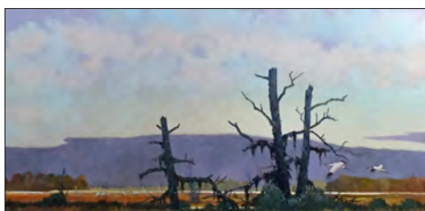
Reunion at Louisville Ponds -Whooping Cranes-