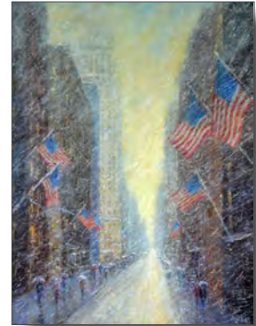
President's Day, Cincinnati

Mark's one person show, Memorable Impressions , continues through October 21st at the Cincinnati Art Gallery, 225 East 6th Street, Cincinnati, Ohio.