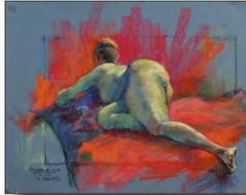
Moving Outside the Box

"Moving Outside the Box," has been selected for inclusion in Strokes of Genius 9 published by North Light Books. The theme of this volume in the series is creative discoveries. The pastel piece was done entirely at a Monday afternoon session of the Club's Sketch Group.